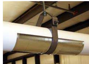
Stays in Hanger