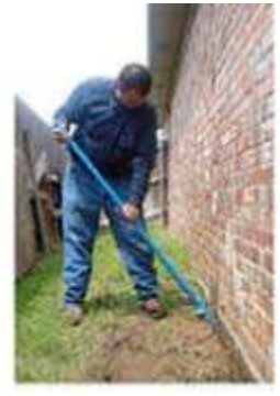
Until step is level with soil