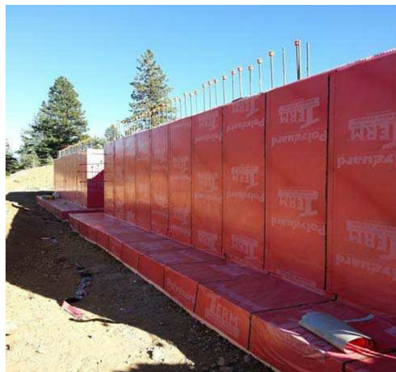
1 - ICF Foundation - Verdi, CA

Polyguard Detail Sealant ensures adhesion to ICF and concrete in difficult areas to seal. Polyguard Detail sealant is a solvent free, non-