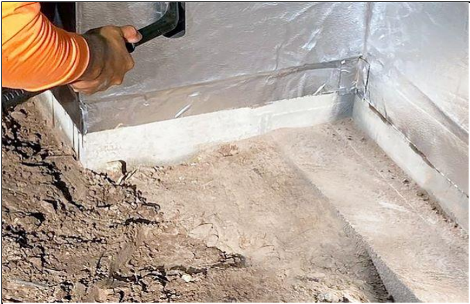
TERM Flashing|Termite Barrier is also available with aluminum foil UV resistant backing, offering up to 12 months UV resistance.

TERM Flashing Barrier can be adversely affected by ultraviolet light. It should be covered as soon as possible and not left exposed to sunlight for over 30 days.