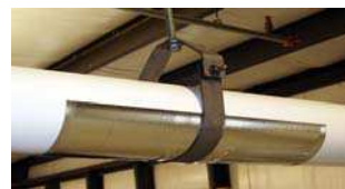
Stays in Hanger