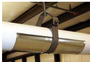
Stays in Hanger