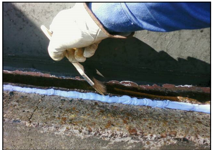
APPLY PRIMER TO CONCRETE AND METAL